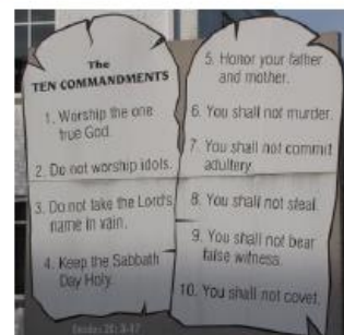
The 10 commandments