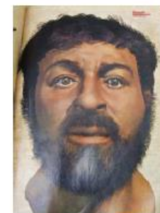
Historical attempt at what Jesus looked like