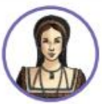
Anne Boleyn (beheaded)