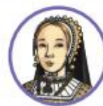
Catherine Howard (beheaded)