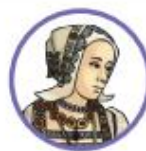
Anne of Cleves (divorced)