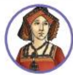
Jane Seymour (died)