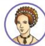
Katherine Parr (survived)